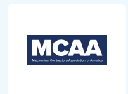
MCAA, United States